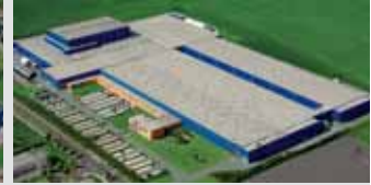
Hörmann KG Ichttershausen, Germany