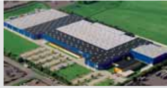
Hörmann KG Brandis, Germany