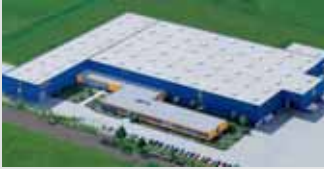
Hörmann KG Dissen, Germany