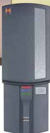
FFL 12 BS radio finger-scan