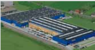
Hörmann KG Werne, Germany