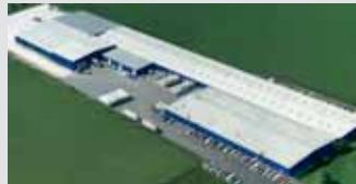
Hörmann LLC, Montgomery IL, USA