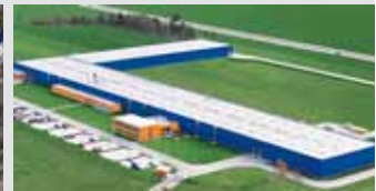
Hörmann Legnica Sp. z o.o., Poland