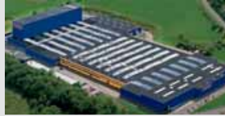
Hörmann KG Freisen, Germany