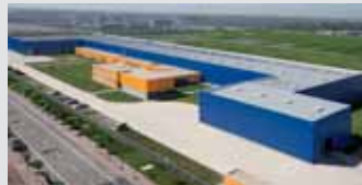
Hörmann Tianjin, China