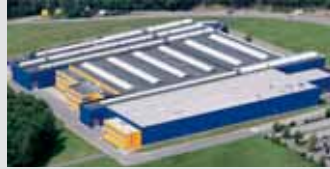
Hörmann KG Eckelhausen, Germany