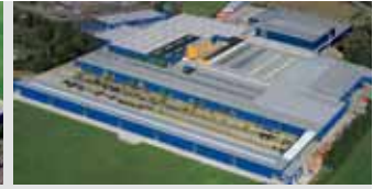
Hörmann KG Brockhagen, Germany