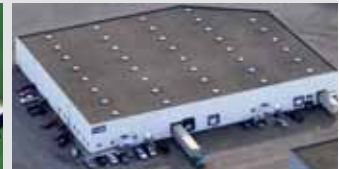
Hörmann Flexon, Leetsdale PA, USA

Hörmann is the only manufacturer worldwide that offers you a complete range of all major building products from one source. We manufacture in highly-specialised factories using the latest production technologies. The close-meshed network of sales and service companies throughout Europe, and activities in the USA and China, make Hörmann your strong partner for first-class building products, offering "Quality without Compromise".