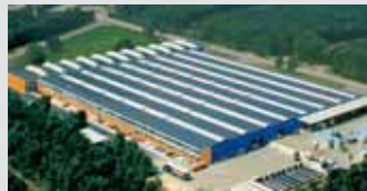
Hörmann Genk NV, Belgium