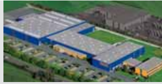
Hörmann KG Antriebstechnik, Germany