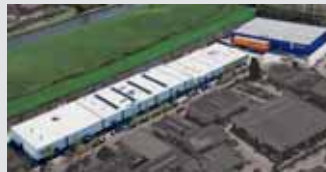
Hörmann Alkmaar B.V., Netherlands