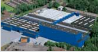
Hörmann KG Amshausen, Germany