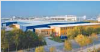
Hörmann Beijing, China